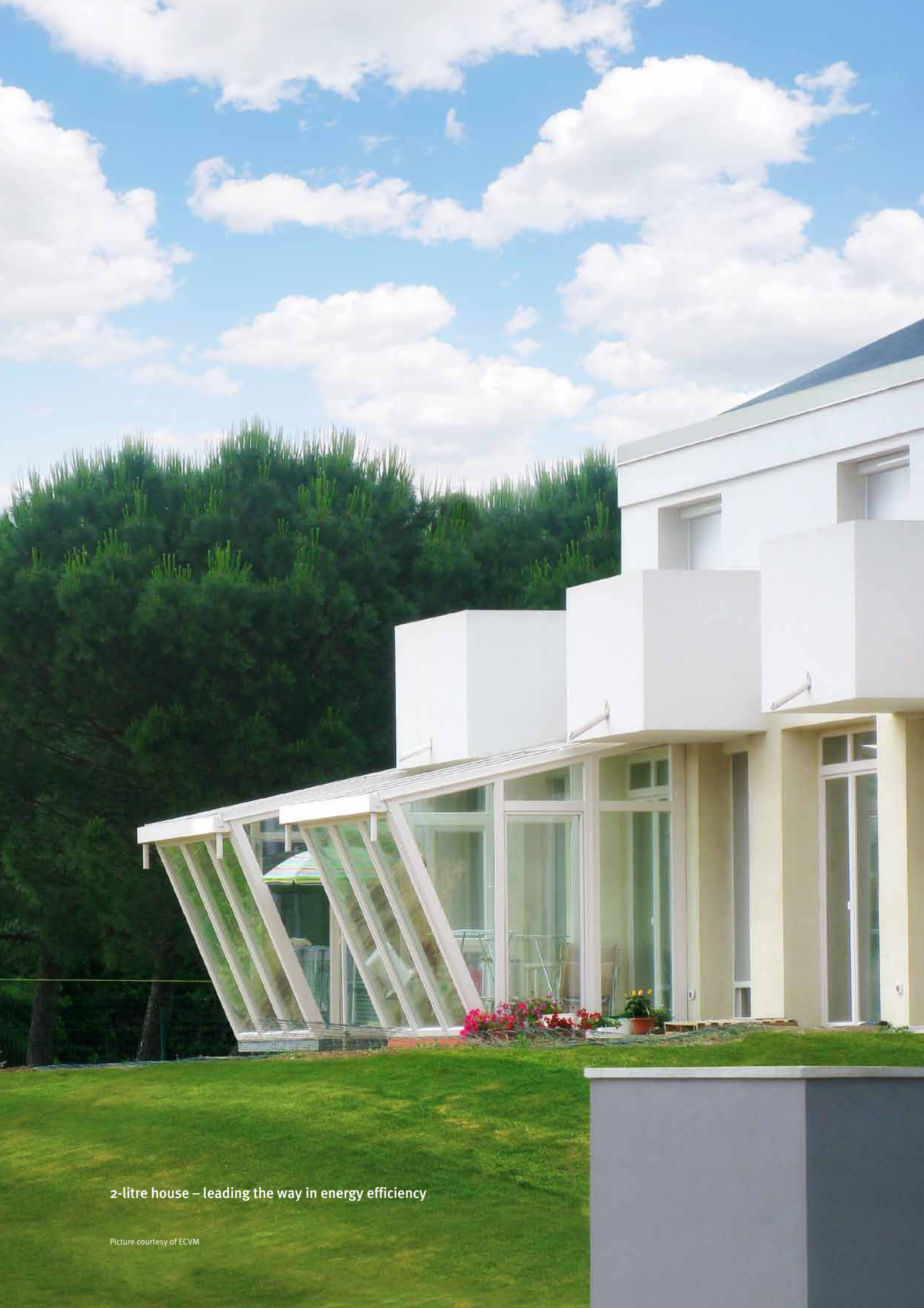
2-litre house – leading the way in energy efficiency